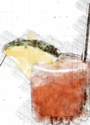
Rum Runner 16

Bacardi Black Rum, Campari, Lime, Pineapple, Demerara