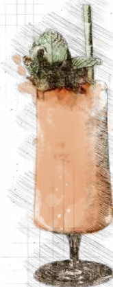
Polynesian Pearl Diver 17

Bugal 1888, El Dorado 12yr, Smith & Cross, Falernum, Cookie Butter, Orange, Lime, Cream, Bitters