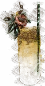
Mai Tai 16

Mount Gay Eclipse, Myer's Dark Rum, Giffard Orgeat, Thai Basil Syrup, Lime