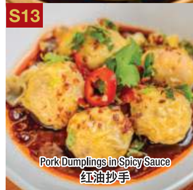
S13 Pork Dumplings in Spicy Sauce 紅油抄手