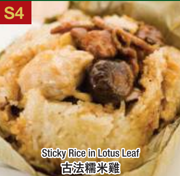
S4 Sticky Rice in Lotus Leaf 古法糯米雞