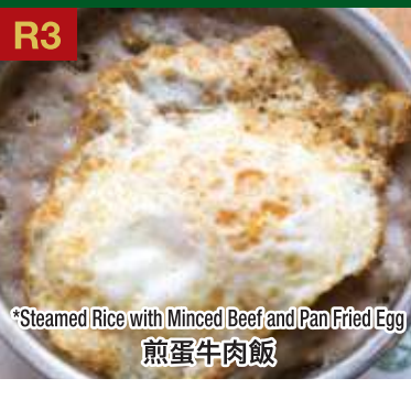
R3 Steamed Rice with Minced Beef and Pan Fried Egg 煎蛋牛肉飯