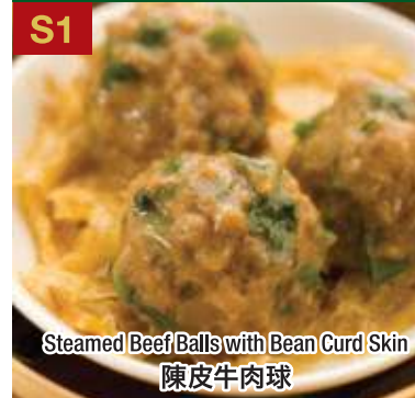
S1 Steamed Beef Balls with Bean Curd Skin 陳皮牛肉球