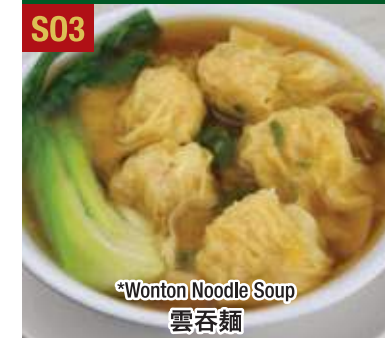
S03 *Wonton Noodle Soup 雲吞麵