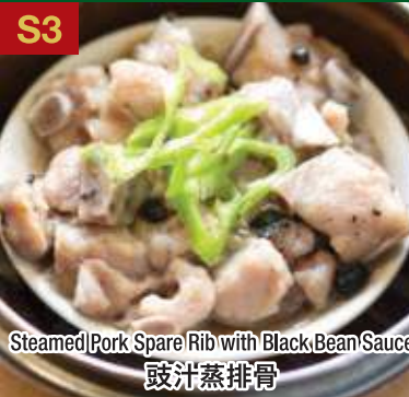
S3 Steamed Pork Spare Rib with Black Bean Sauce 豉汁蒸排骨