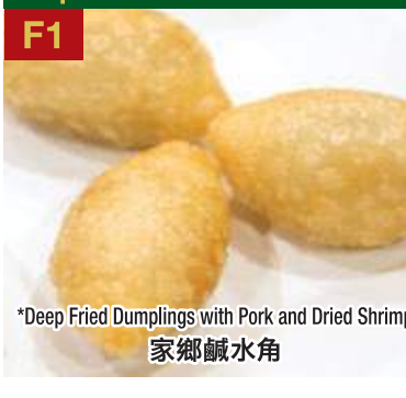
F1 *Deep Fried Dumplings with Pork and Dried Shrimp 家鄉鹹水角