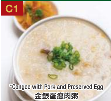
C1 *Congee with Pork and Preserved Egg 金銀蛋瘦肉粥