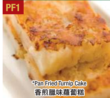
PF1 *Pan Fried Turnip Cake 香煎臘味蘿蔔糕