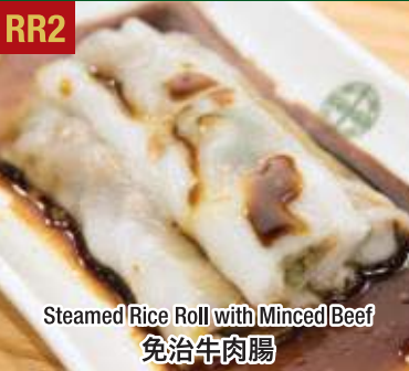
RR2 Steamed Rice Roll with Minced Beef 免治牛肉腸