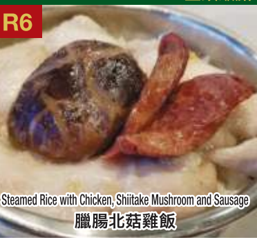
R6 Steamed Rice with Chicken, Shiitake Mushroom and Sausage 臘腸北菇雞飯