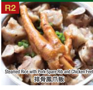
R2 Steamed Rice with Pork Spare Rib and Chicken Feet 排骨鳳爪飯