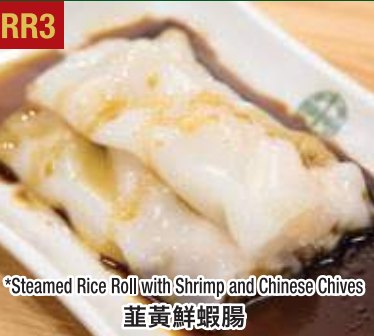
RR3 *Steamed Rice Roll with Shrimp and Chinese Chives 韭黃鮮蝦腸