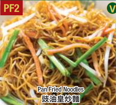
PF2 Pan Fried Noodles 豉油皇炒麵