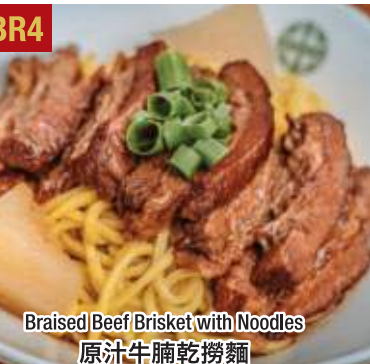
BR4 Braised Beef Brisket with Noodles 原汁牛腩乾撈麵