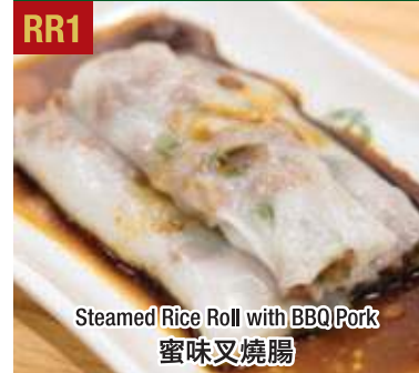
RR1 Steamed Rice Roll with BBQ Pork 蜜味叉燒腸