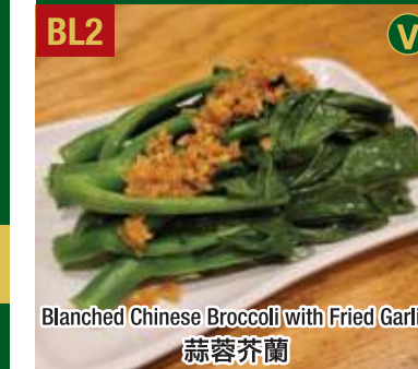
BL2 Blanched Chinese Broccoli with Fried Garlic 蒜蓉芥蘭