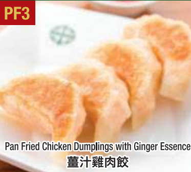
PF3 Pan Fried Chicken Dumplings with Ginger Essence 薑汁雞肉餃