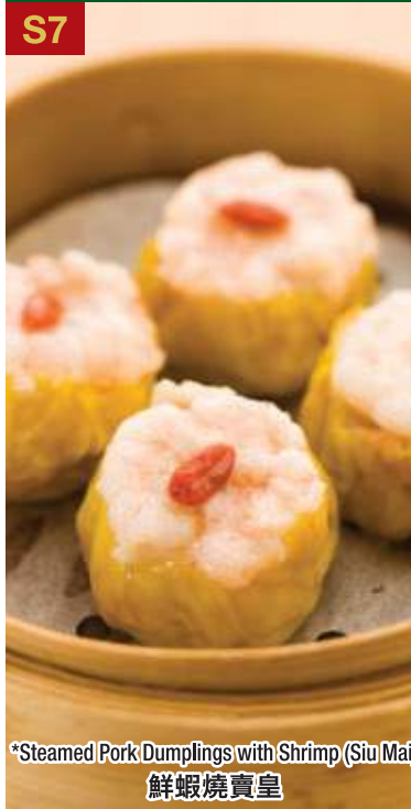
S7 *Steamed Pork Dumplings with Shrimp (Siu Mai) 鮮蝦燒賣皇