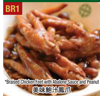
BR1 *Braised Chicken Feet with Abalone Sauce and Peanut 美味鮑汁鳳爪