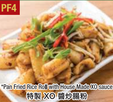
PF4 *Pan Fried Rice Roll with House Made XO sauce 特製 XO 醬炒腸粉