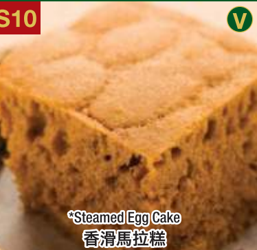
S10 *Steamed Egg Cake 香滑馬拉糕