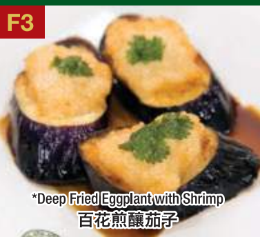
F3 *Deep Fried Eggplant with Shrimp 百花煎釀茄子