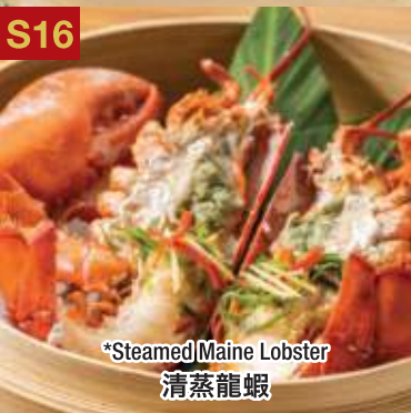
S16 *Steamed Maine Lobster 清蒸龍蝦