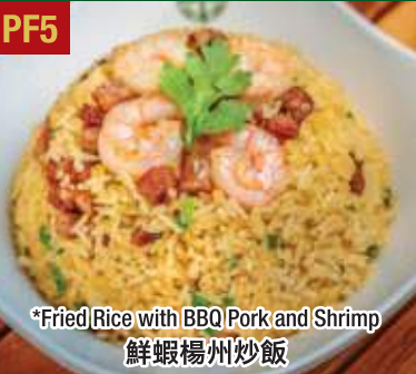
PF5 *Fried Rice with BBQ Pork and Shrimp 鮮蝦揚州炒飯