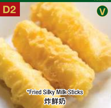
D2 *Fried Silky Milk Sticks 炸鮮奶