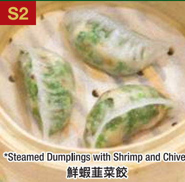
S2 *Steamed Dumplings with Shrimp and Chives 鮮蝦韭菜餃