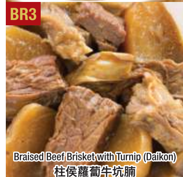
BR3 Braised Beef Brisket with Turnip (Daikon) 柱侯蘿蔔牛坑腩