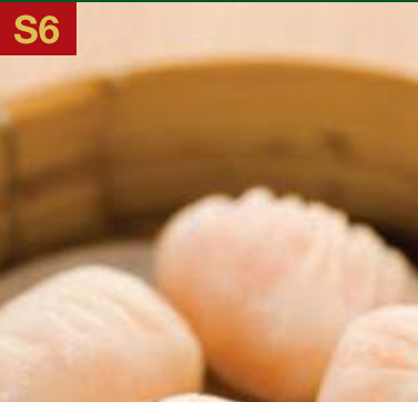
S6 *Steamed Shrimp Dumplings (Har Gow) 晶瑩鮮蝦餃