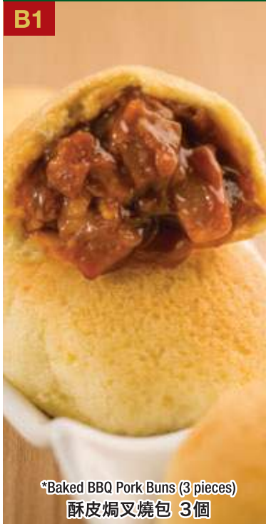
B1 *Baked BBQ Pork Buns (3 pieces) 酥皮焗叉燒包 3個