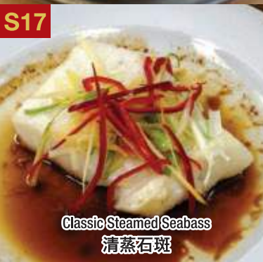
S17 Classic Steamed Seabass 清蒸石斑