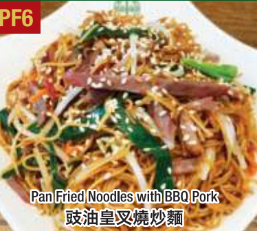
PF6 Pan Fried Noodles with BBQ Pork 豉油皇叉燒炒麵