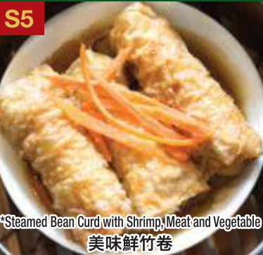
S5 *Steamed Bean Curd with Shrimp, Meat and Vegetable 美味鮮竹卷