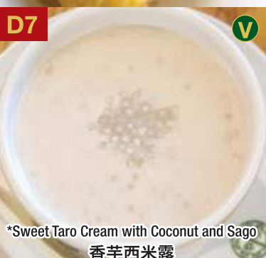
D7 *Sweet Taro Cream with Coconut and Sago 香芋西米露