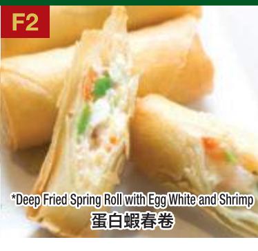
F2 *Deep Fried Spring Roll with Egg White and Shrimp 蛋白蝦春卷