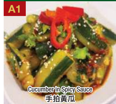
A1 Cucumber in Spicy Sauce 手拍黃瓜